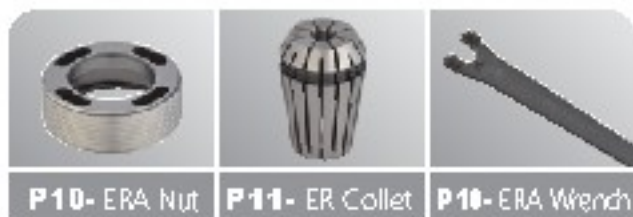
P10- ERA Nut