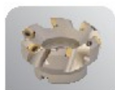
P174/175 Face Mill Cutter