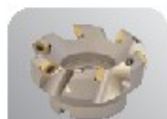
P174/175- Face Mill Cutter