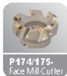
P174/175- Face Mill Cutter