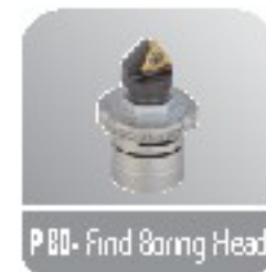
PCD-Fine Boring Head