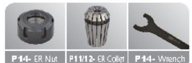
P14- ER Nut