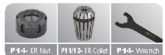
P14- ER Nut