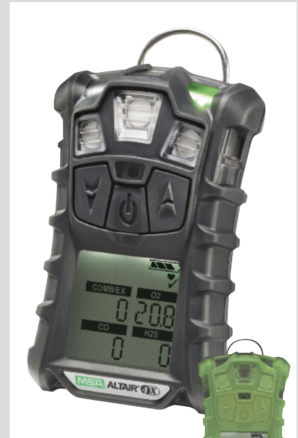
Phosphorescent housing available