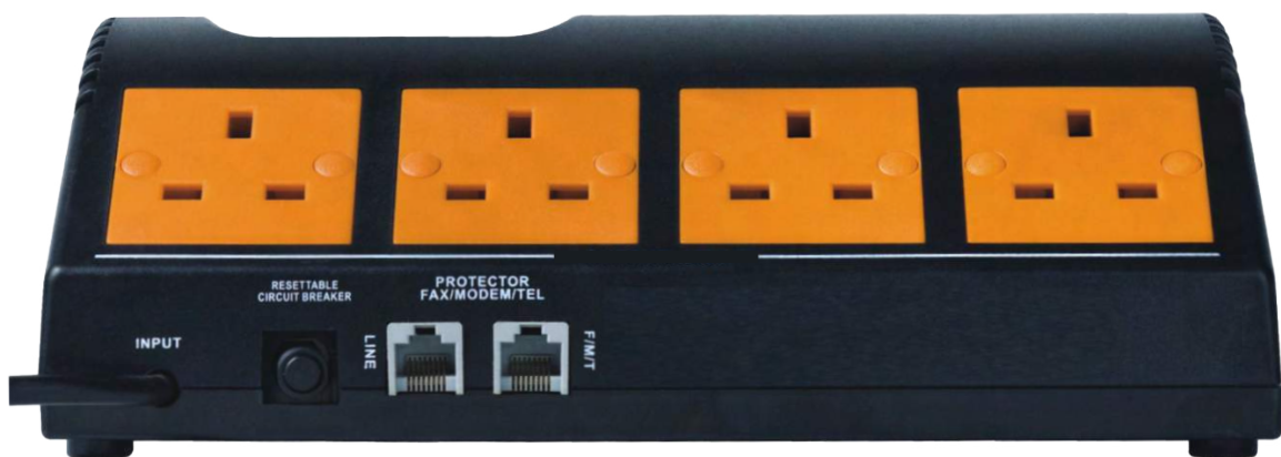
Side view of both AVS 800 CBM and AVS 1000 CBM

A feature that controls and maintains a constant and quality output for users.