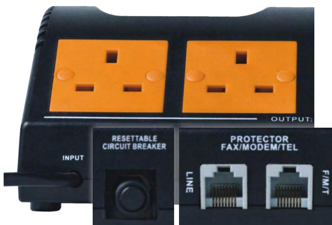
Side view of both AVS 800 CBM and AVS 1000 CBM

Prevents the transformer from overheating and to ensure AVS performance stability.