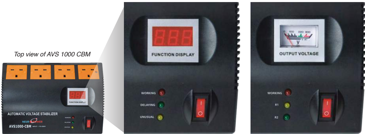
Top view of AVS 1000 CBM

The perfect choice for small power scenarios with the capacity to prevent power surges and spikes.