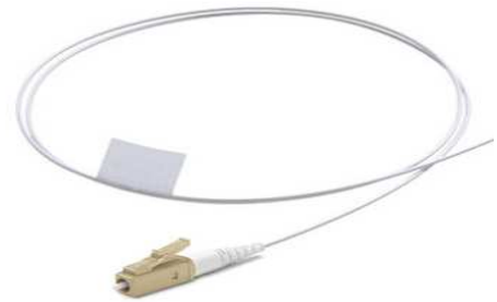
LC PIGTAIL MULTI MODE