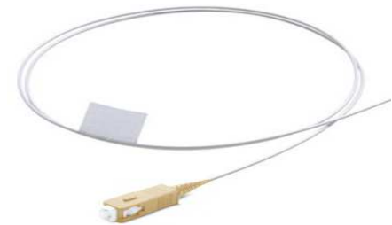
SC PIGTAIL MULTI MODE