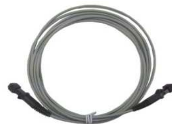
MTRJ - MTRJ