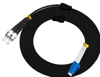
LC - ST