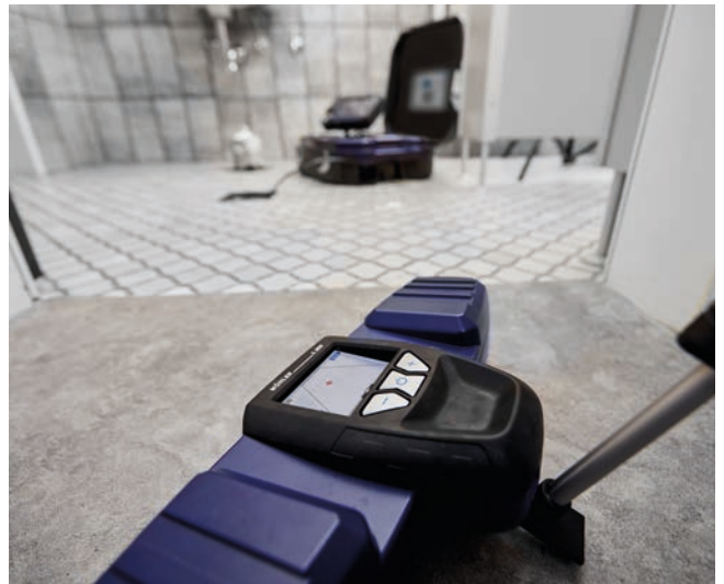
Precise location of the camera head with the Wöhler L 200 Locator