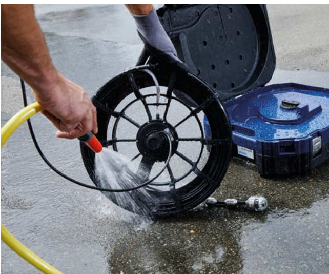
Fast cleaning for lasting hygiene: Simply splash the robust case and the viper with water