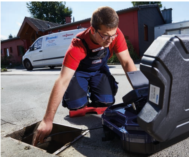
Secure drain inspection with the waterproof camera head