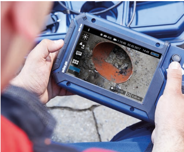
Razor sharp pictures in HD-quality, clear menu and comfortable to hold