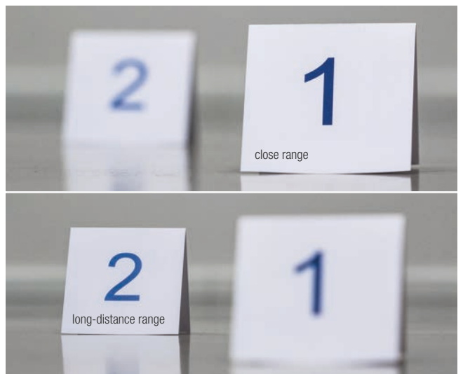
The focus function makes it possible to precisely control the depth of focus