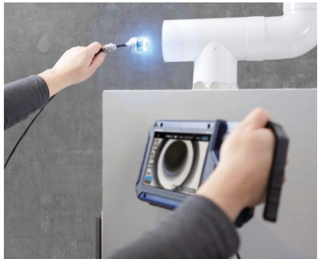
Inspection of flue gas lines from Ø 56 mm: easily negotiates tight bends of 87°