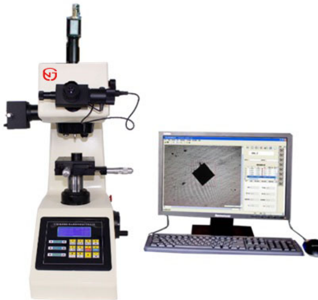
Equipped with video system or CCD measuring system