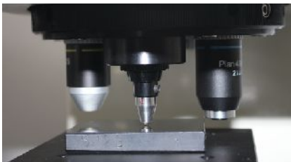
Indenter & Objective