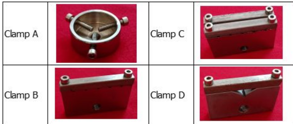
Fixture A, B, C, D