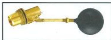
FOC 3/4 INCH FLOAT VALVE