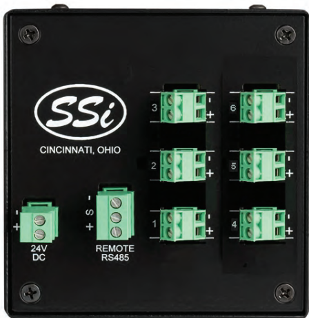
SR Module (6 inputs displayed)