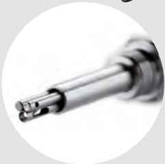
Special straight Pitot tube