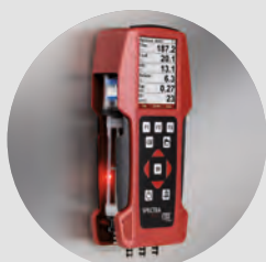
Strong hold due to fixing magnets

Measuring data can be stored internally in the analyser or on SD-card – the data can also be immediately transferred via Bluetooth to PC or printed directly with the MRU speed printer.