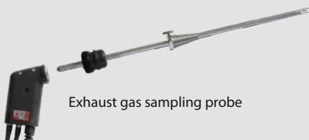
Exhaust gas sampling probe

Combustion and emission calculations: mg / Nm 3 , NO x as mg / m 3 NO 2 , true NO x = NO + NO 2 , with O 2 referencing