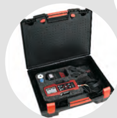
Robust ABS case