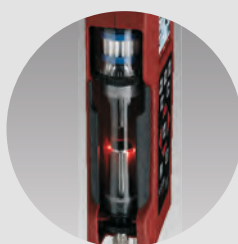
Optimized, backlit condensate trap with re-usable PTFE filter