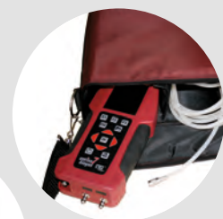
Soft bag with shoulder strap