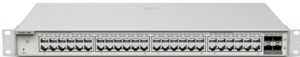
Fig 2 RG-NBS3200-48GT4XS / RG-NBS3200-48GT4XS-P