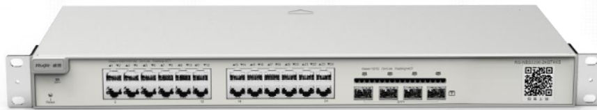
Fig 1 RG-NBS3200-24GT4XS