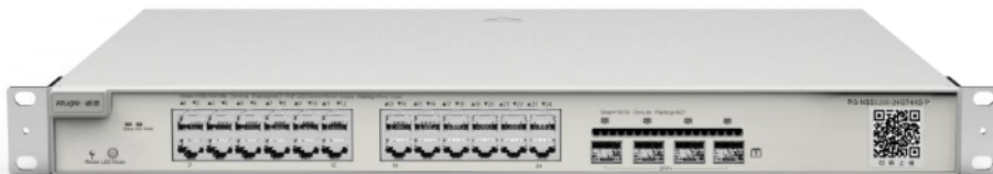
Fig 4 RG-NBS3200-24GT4XS-P