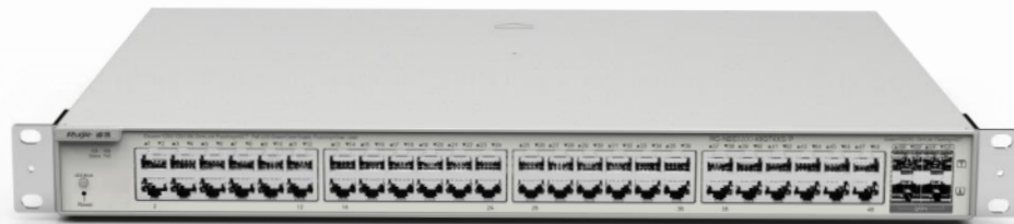
Fig 5 RG-NBS3200-48GT4XS-P