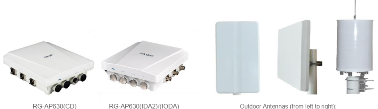
Outdoor Affermas (non-feit to right).

Outdoor AP Series thereby offers unparalleled productivity in a wide variety of outdoor networking solutions.