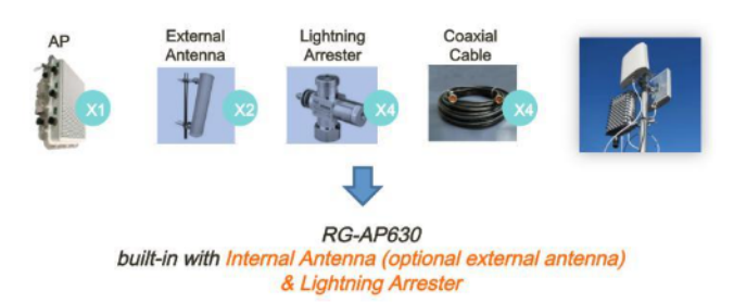
All-in-one Installation Package

The RG-AP630 Outdoor AP Series offers you a one-stop installation package. Everything you need is included, from external antennas to lightning arresters and coaxial cables, for effortless outdoor deployment.