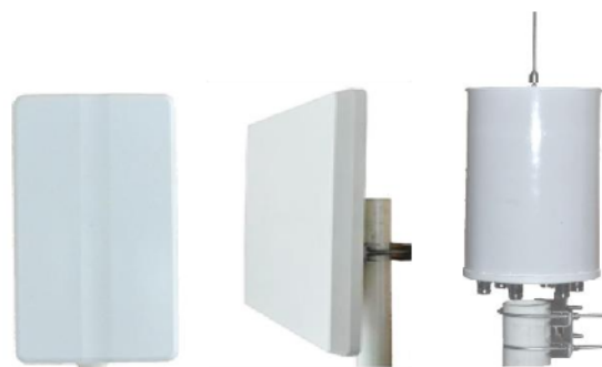
Outdoor Antennas (from left to right):