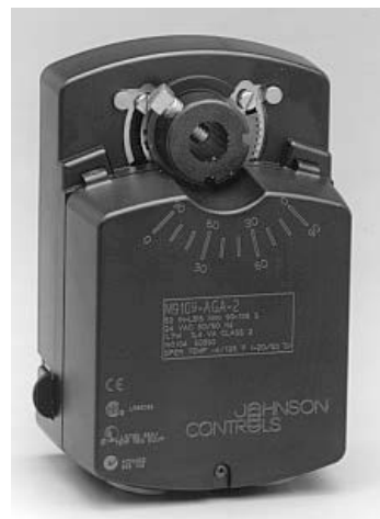
Figure 1: M9109 Non-spring Return Actuator

The M9109 models have an 80 lb-in (9 N-m) running torque. They have a nominal 60-second travel time for 90° of rotation at 60 Hz (72 seconds at 50 Hz) with a load-independent rotation time. The M9109-xGC-2 models are available with integral auxiliary switches to perform switching functions at any angle within the selected rotation range. Position feedback is available through a 0 (2) to 10 VDC signal on the M9109-GGx-2 models.