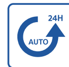
24 Hour Timer