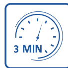
3 Minutes Protection