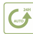
24 Hour Timer