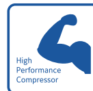
High Performance Compressor