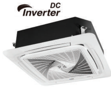
(Applicable to 26,500~50,000 Btu/hr)