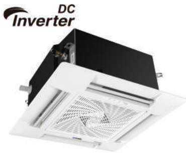
(Applicable to 10,500~18,500 Btu/hr)