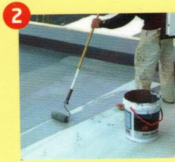
2 First layer