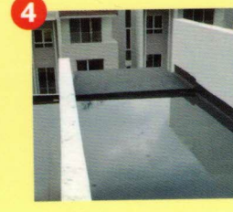
4 Ponding test