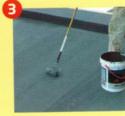
3 Second layer