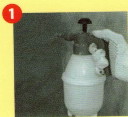
1 Surface preparation