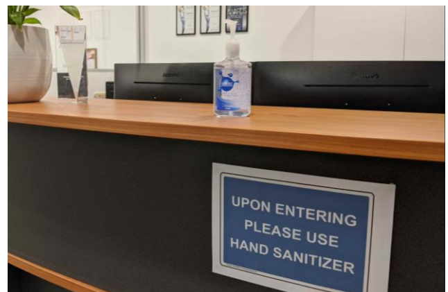
USEFUL FOR PUBLIC PLACES LIKE OFFICES AND SCHOOLS