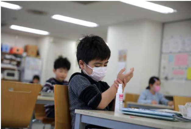
SAFE FOR USE WITH CHILDREN AND ALL AGES