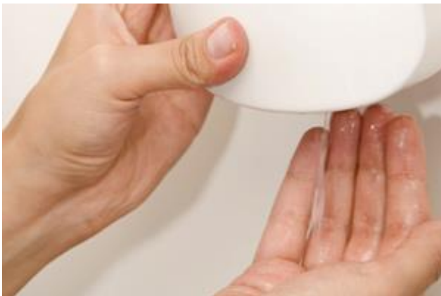
BIGGER SIZES FOR ECONOMICAL USE