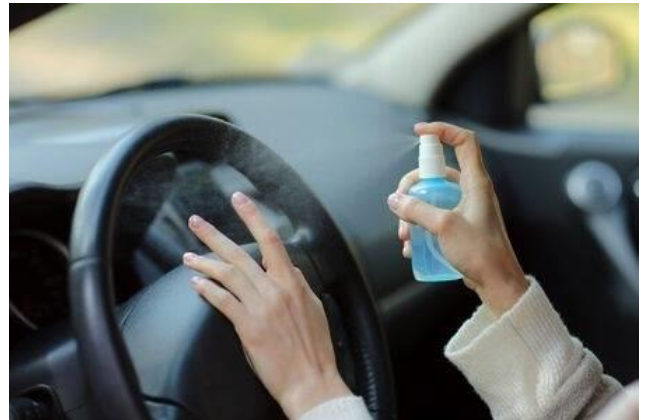
EASY TO CARRY AND QUICK SANITIZING FOR EASE OF MIND