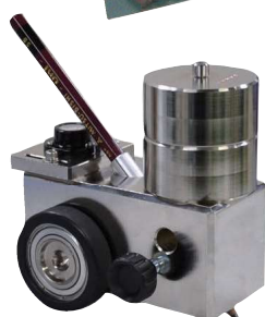
No.553-S (3 Loads Spec)