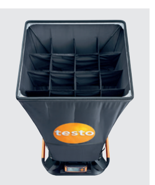
Flow straightener for significantly more precise measurements at swirl outlets.