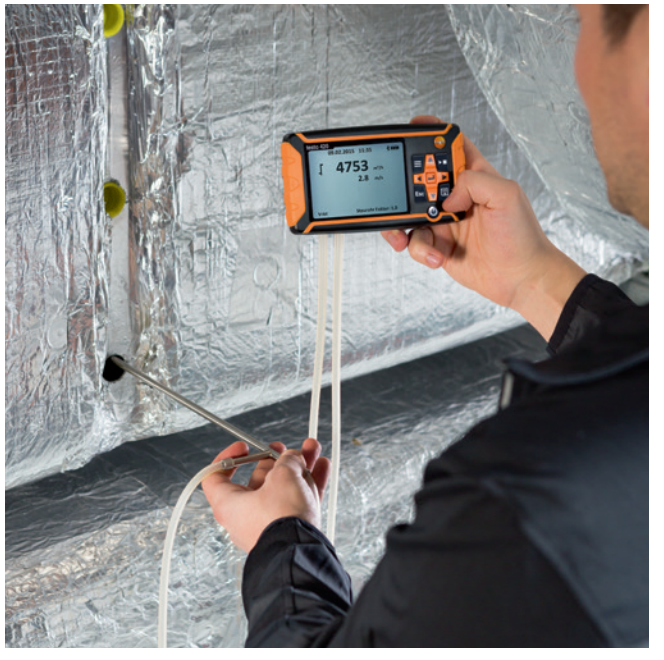
Removable instrument allows Pitot tube measurements in ducts (Pitot tube available separately)