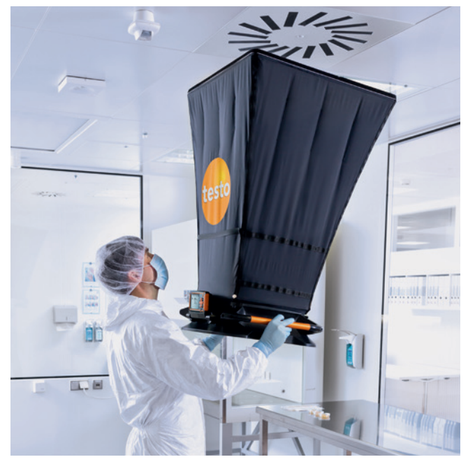
Comfortable measurement thanks to low weight