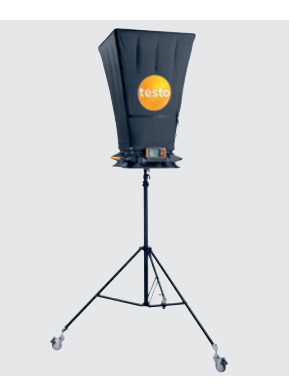
Stable, wheeled tripod with central fitting for secure working at high ceiling outlets.