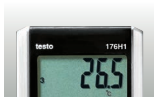
Large, clear display for showing measurement values