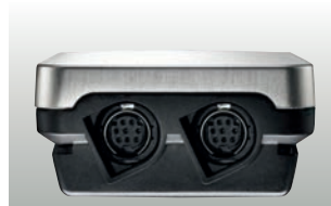
Probe connection at lower end of housing for two temperature/humidity probes