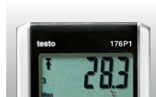
Large, clear display for showing measurement values