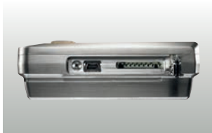
Lateral connection of Mini USB cable and SD card

* Not for condensing atmospheres. For continuous applications in high humidity (>80 %RH at ≤30 °C for >12 h, >60 %RH at >30 °C for >12 h), please contact us via our website.