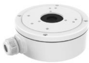
DS-1280ZJ-XS Junction box