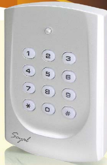
AR721H Controller with built-in reader

CCTV integration Camera can capture picture for every in and out as visual evidence. This greatly enhances the effectiveness of access control and accuracy of attendance clocking.