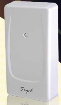
AR721U Auxiliary Wiegand reader