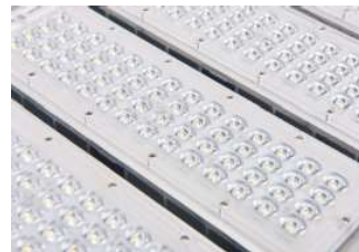
Fire Free PC Lens