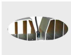
AL Fins Heatsink