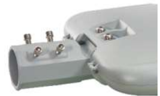
Standard Steel Screw used