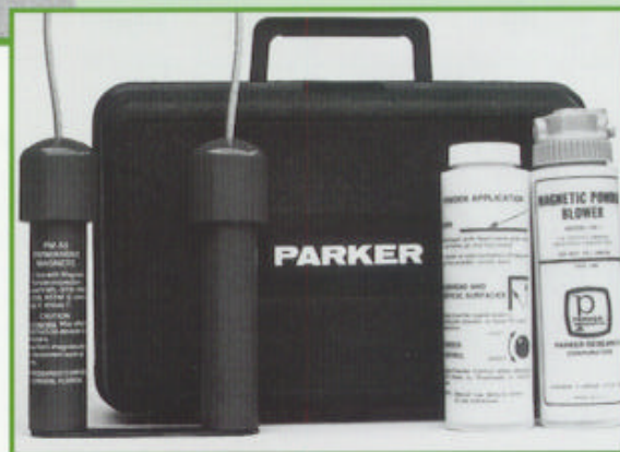
PM-50-A Inspection Kit

Order Yoke set separately or with the complete kit which includes: plastic carrying case, one pound of red and gray dry inspection powder and the PB-1 Powder applicator.