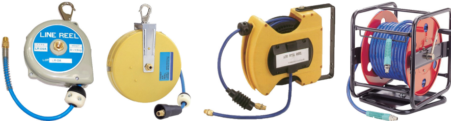
GP-RB02/RB02B GP-RB01A/B GP-RB03F/G GP-RB03A/B/C/D GP-815H/816H/817H GP-815H1/816H1/817H1