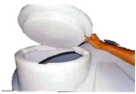
Tight On Loose Cover