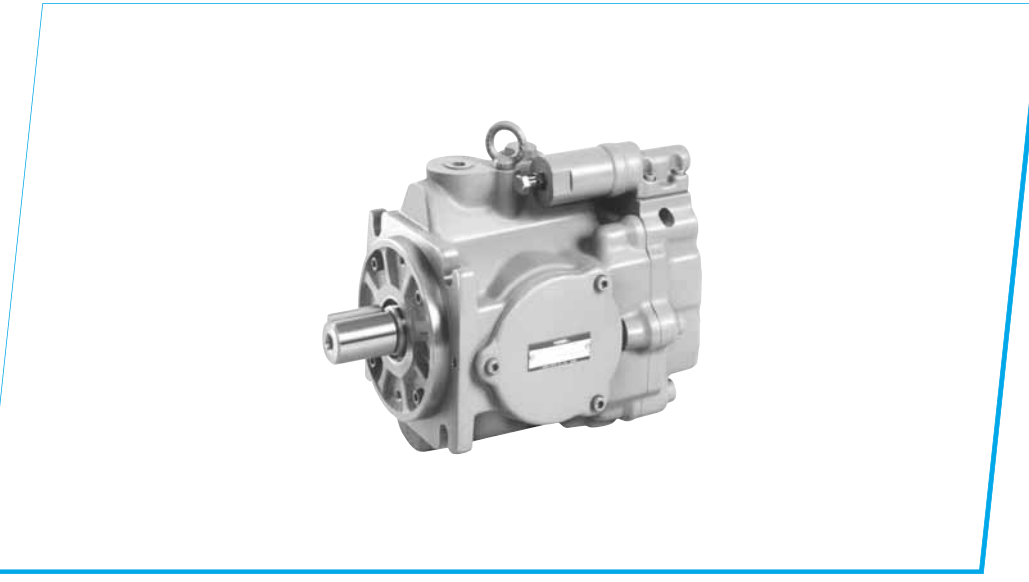
"A3H" Series Variable Displacement Piston Pumps

"A" Series Variable Displacement Piston Pumps