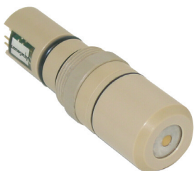
AquaSensors DataStick AquaTrace DO Sensor Head