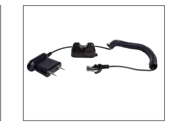
MR02 Standard External Pin Probe

Designed for use with the FLIR MR277 to take accurate temperature and humidity measurements. The MR13 is factory calibrated and features a protective cap. A metallic screw secures the probe in place.