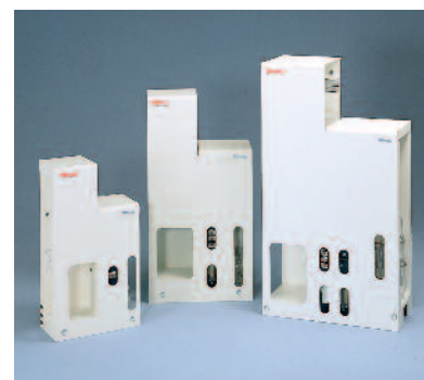
Mega-Pure Glass Stills