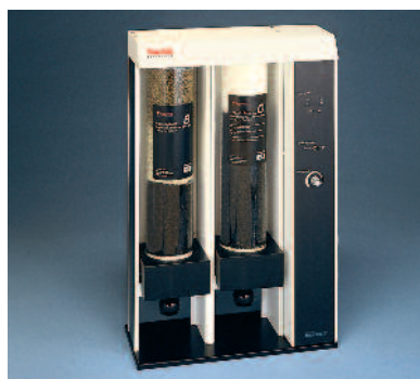
Mega-Pure D2 Deionizer