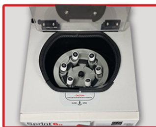
6 position swing out rotor

Optional adapters for above, accepts 5-7ml tubes, 6/pk