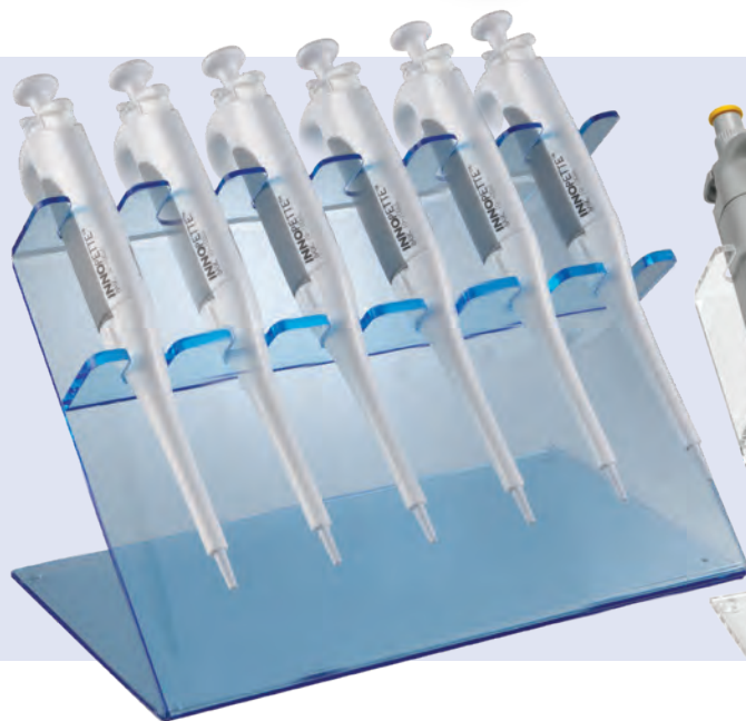
6-Place Stand Acrylic Blue