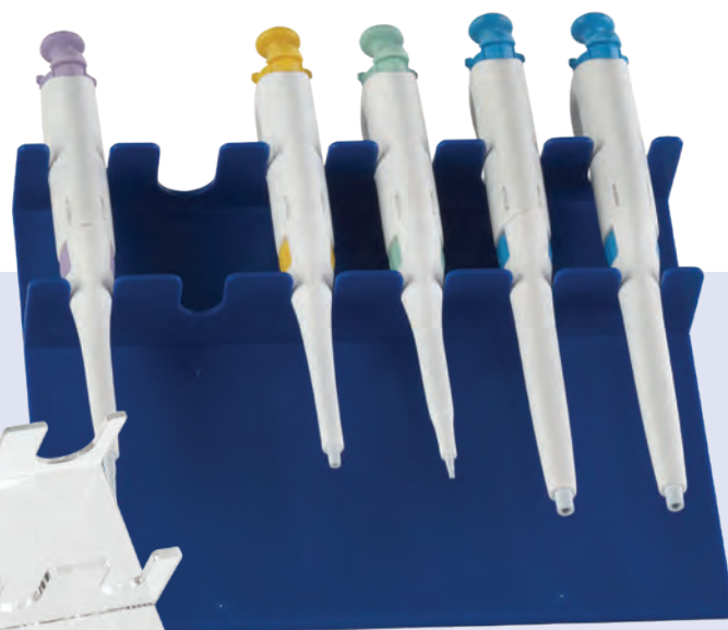
6-Place Stand ABS Blue