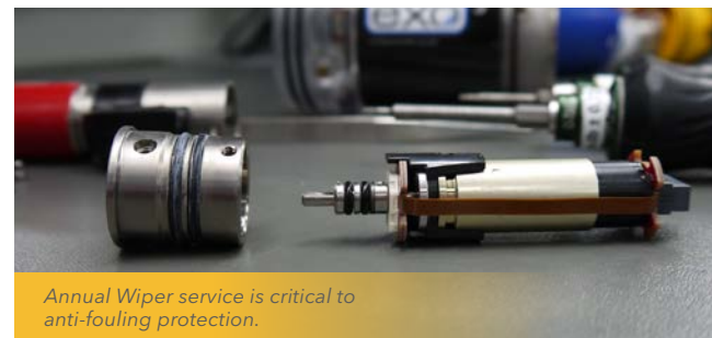
Annual Wiper service is critical to anti-fouling protection.