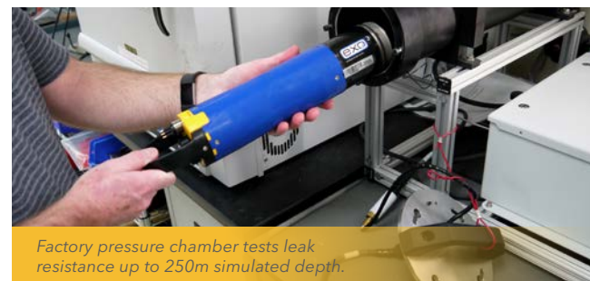
Factory pressure chamber tests leak resistance up to 250m simulated depth.