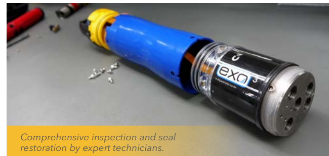
Comprehensive inspection and seal restoration by expert technicians.