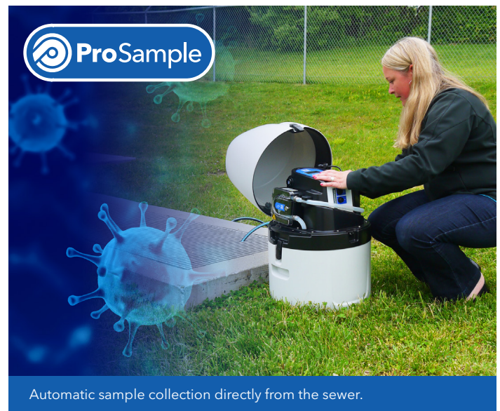
Automatic sample collection directly from the sewer.

A more coherent strategy is “surveillance.” People infected with SARS-CoV-2 shed the virus in their stool even before they show symptoms of COVID-19. Through a Wastewater Surveillance Program (WSP), the amount of viral material in wastewater can reveal the level of COVID-19 spread in a population, and trigger necessary response plans and mitigation actions, such as individual testing and isolation. This Wastewater Based Epidemiology (WBE) is a critical tool in containing and mitigating COVID-19 outbreaks. At the time of publishing this application note, numerous countries, such as Australia, Italy, Finland, Netherlands, USA, and Pakistan, have implemented WSPs.