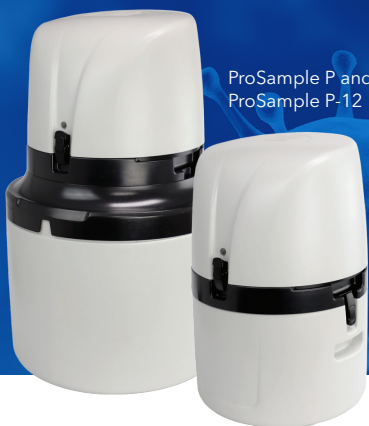
ProSample P and ProSample P-12

Automatic sample collection directly from the sewer.