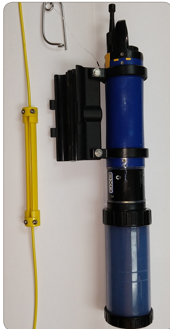
Figure 3: Yellow core-clamp portion

The spring clip is attached to the main assembly via a monofilament lanyard. The loop of the lanyard installs in different location depending on the deployment configuration.