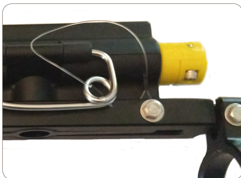
Figure 4: EXO2 lanyard connection

The lanyard is pinned between the spreader bar and the hinged clamp body (Figure 4).