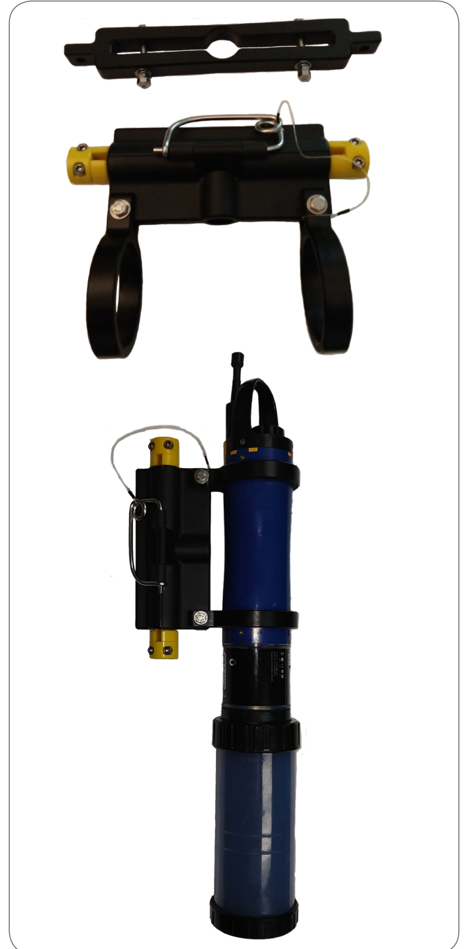
Figure 2: EXO3