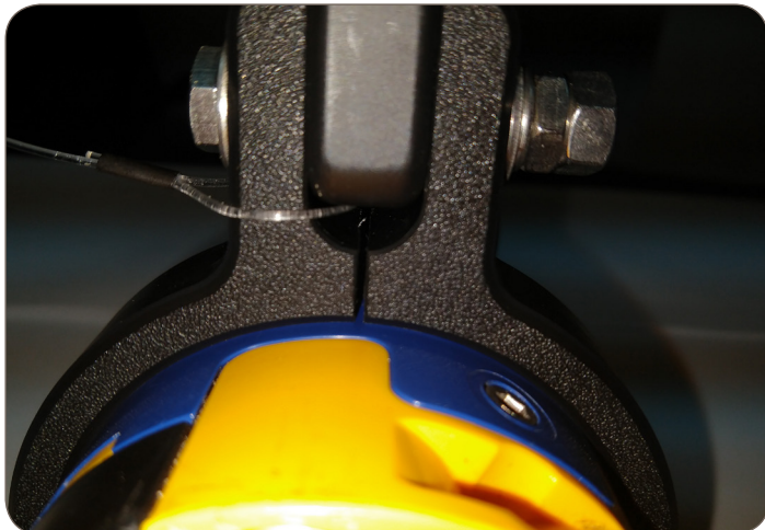
Figure 5: EXO3 lanyard connection

When installed on an EXO 3 it is important to keep the lanyard end within the semi-circular free space of the sonde clamp-ring (Figures 5 and 6). Avoid trapping the lanyard either above or below this point as this negatively affects the grip performance of the assembly on the body of the sonde.