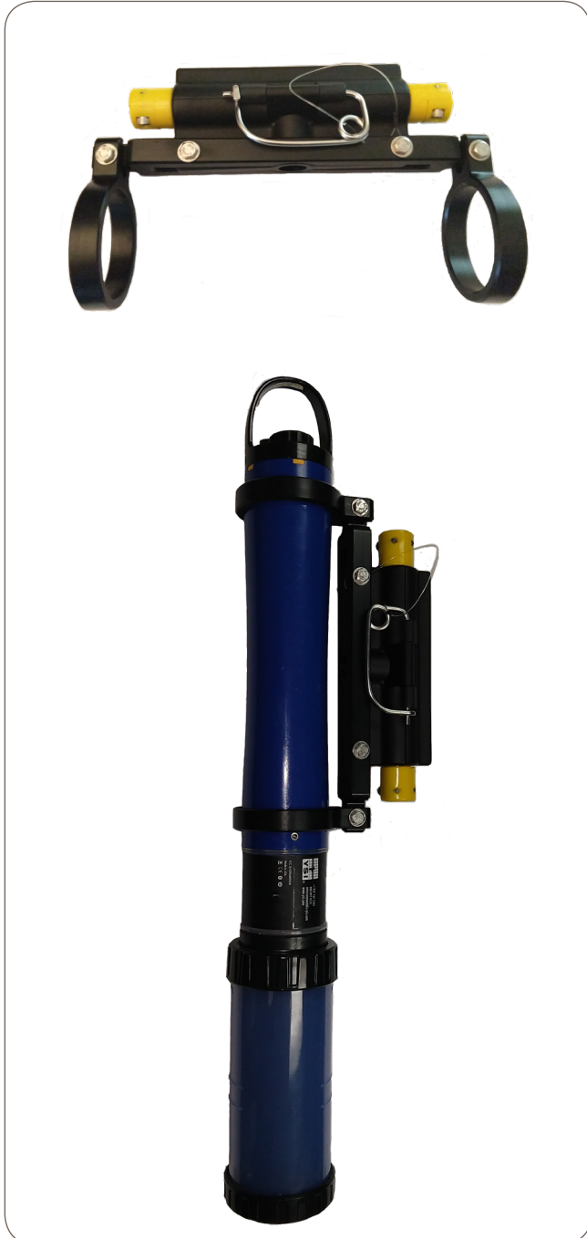
Figure 1: EXO2

The mooring clamp is sized for both EXO 2 and EXO 3 and can be deployed in either configuration as shown. When installed on an EXO 3, the spreader bar is removed and stored elsewhere.