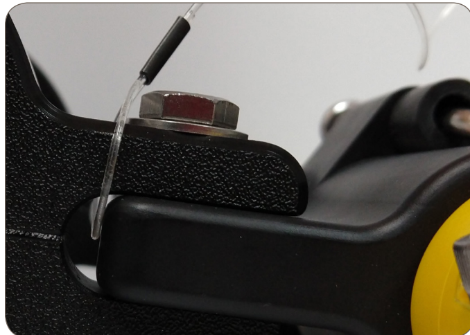
Figure 6: EXO3 lanyard connection

When assembling the hardware, the thin nut installs on the through-bolt and lock washer prior to the standard nut. All metal hardware is 316 stainless steel and 1/4-20 UNC thread (Figure 7).