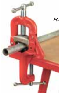
Portable Yoke Vice