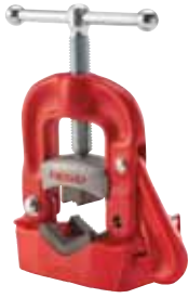
Bench Yoke Vice