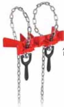
Angle Pipe Welding Vise