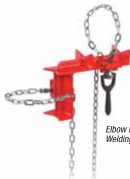
Elbow Pipe Welding Vise