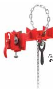
Flange Pipe Welding Vise