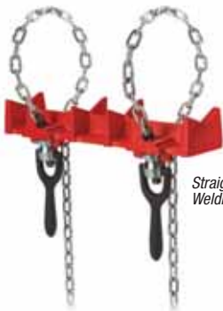
Straight Pipe Welding Vise