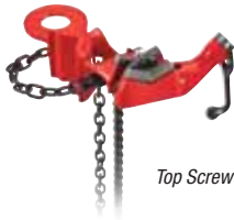
Top Screw Post Chain Vise