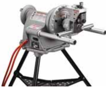
975 Roll Groover with Power Drive