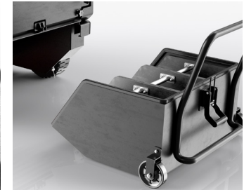
Wheeled hopper with optional mini containers