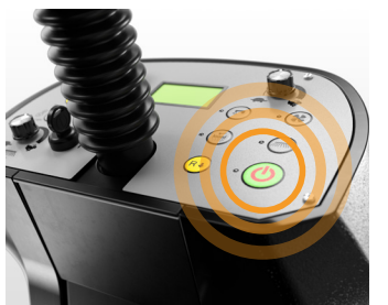
One touch start activates all main functions